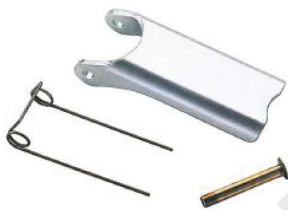
S-4088 Alloy Hook Latch Kits