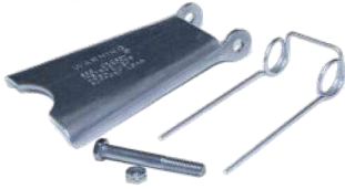
SS-4055 Latch Kits